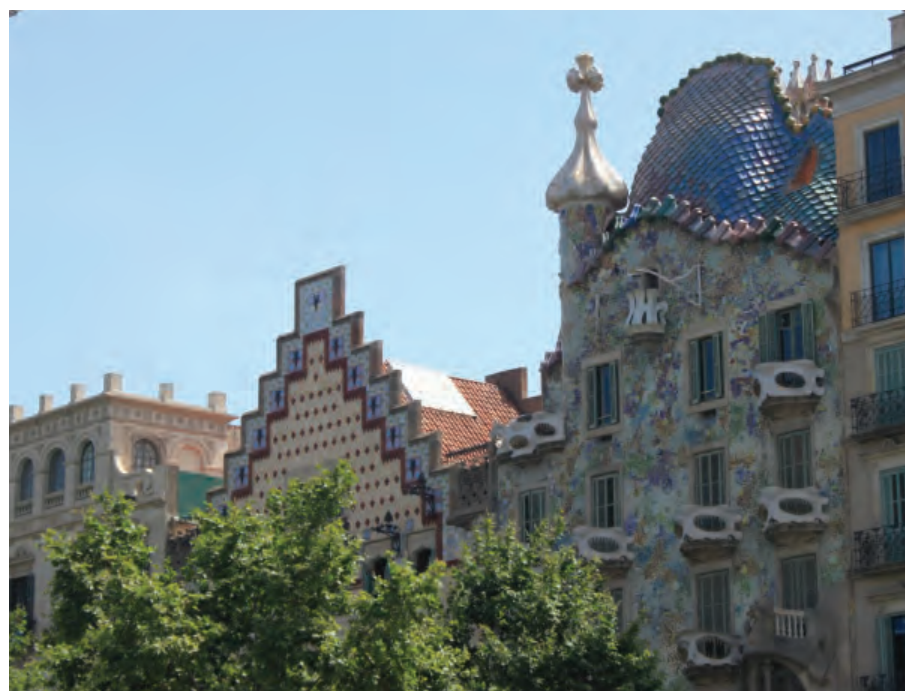
Casa Batllo, Barcelona

painting which was inspired by the town's bombing during the Spanish Civil War, which makes for an excellent excursion by bus or train. As the sun sets, wander down the Gran Vía de Don Diego López de Haro to soak up the lively street entertainment, dip in and out of the shops, and enjoy the cosmopolitan side to Spain.