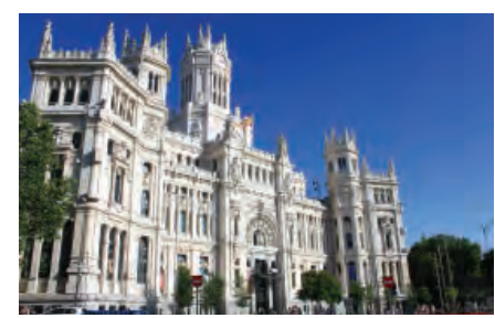
Madrid Town Hall

Perhaps spend a few hours at leisure in Madrid before you catch your return flight to the UK.